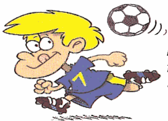
He has been playing football with his friends all afternoon.